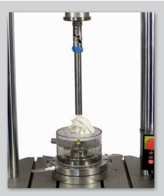
Combined axial and torsional loadings can be applied to intervertebral disc replacements according to ASTM F2346.