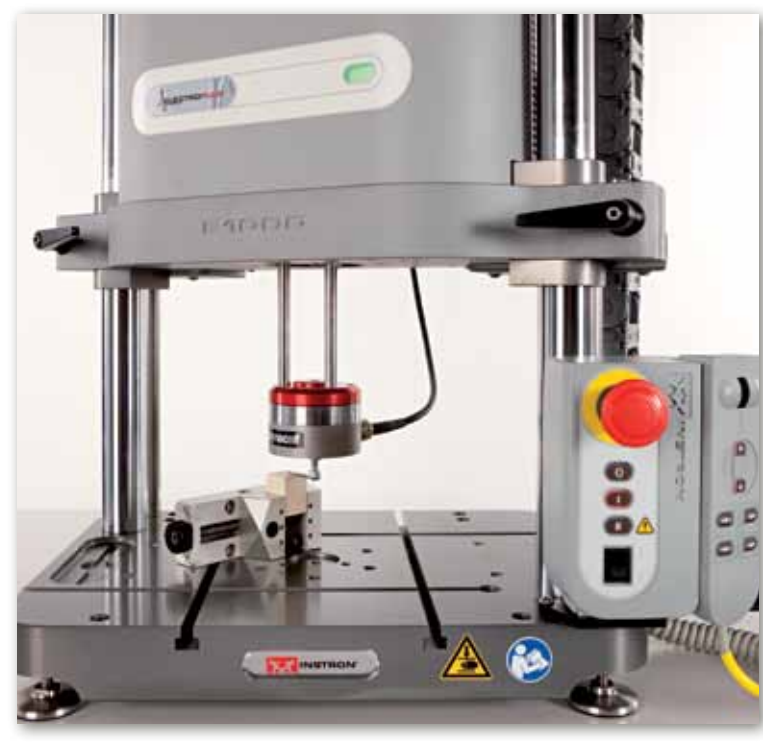
Fatigue tests of fixation devices for phalangeal, metacarpal, and carpal bones tested on ElectroPuls ^{\rm TM} .