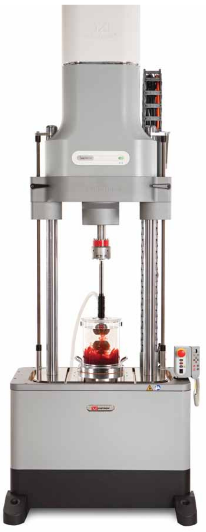
The ElectroPuls™ E10000 Linear-Torsion test instrument can be fitted with a saline bath for long-term fatigue tests, or can be used to perform combined linear-torsion tests on whole bones.