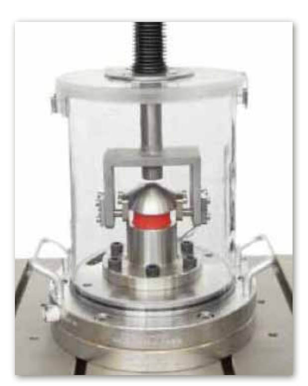
Intervertebral body fusion devices can be tested to ASTM F2077 and F2267 on either the ElectroPuls ^{\text{TM}} or 8870 servohydraulic fatigue systems.