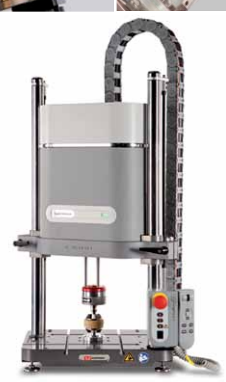
Photo (Right) ElectroPuls ^{\text{TM}} Dynamic Test Instruments offer high frequency fatigue and static test capability using only single-phase electrical power.

Instron® has considerable experience of mechanical testing in orthopaedics: from basic static testing of raw materials, to impact loading of joint components, through to complete simulation for evaluating the fatigue and wear properties in vivo. Through every phase of implant development, our solutions meet a vast array of demands found within the orthopaedics field. These include hip and knee implants, spinal devices, and medical devices for trauma and osteosynthesis.