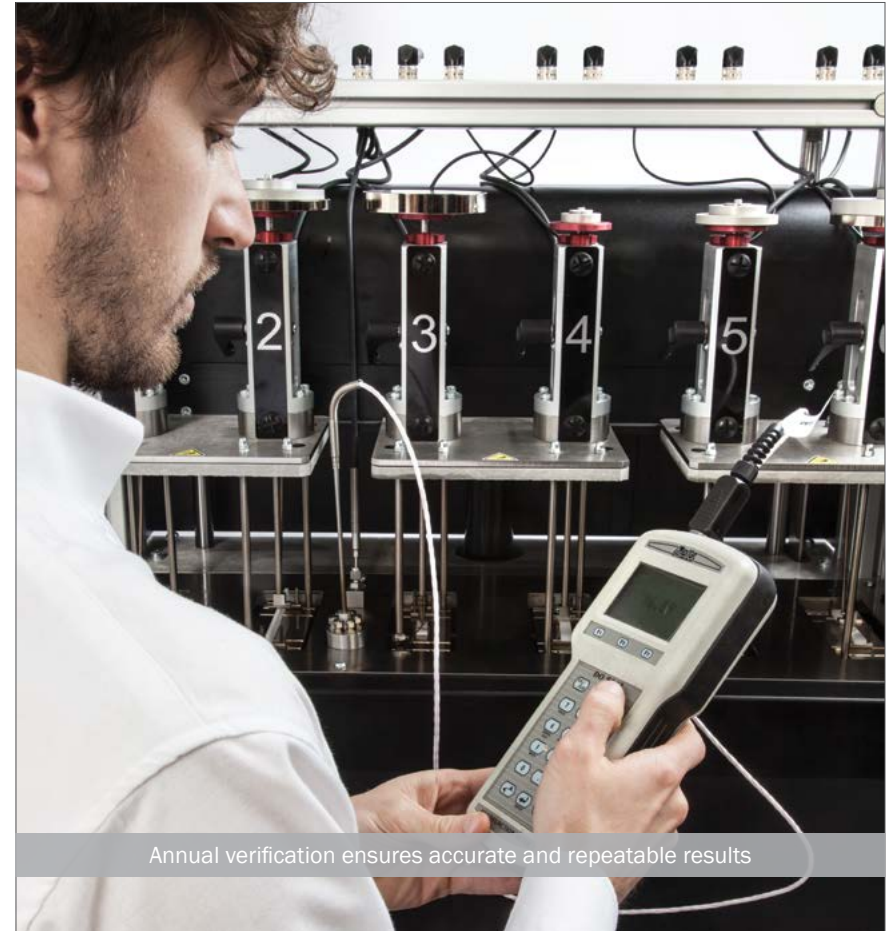
Annual verification ensures accurate and repeatable results

Factory trained engineers provide comprehensive verifications, checking the dimensions of critical components and temperature behavior, to assure results are accurate and repeatable. The verification certificates provide full traceability, providing confidence in the laboratory's results.