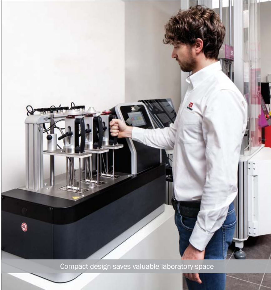
Compact design saves valuable laboratory space

Integrated Innovations for Efficient Tests