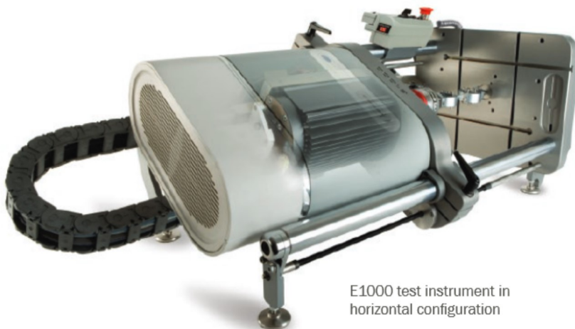
E1000 test instrument in horizontal configuration