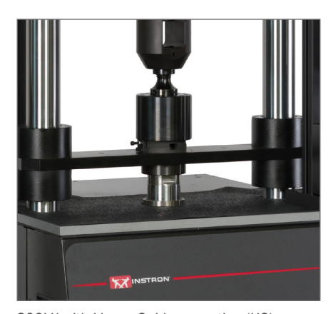
300LX with Linear Guidance option (H2)