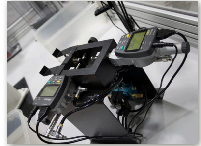
Dual-Axis Vertical Measurement Device, Mitutoyo Based