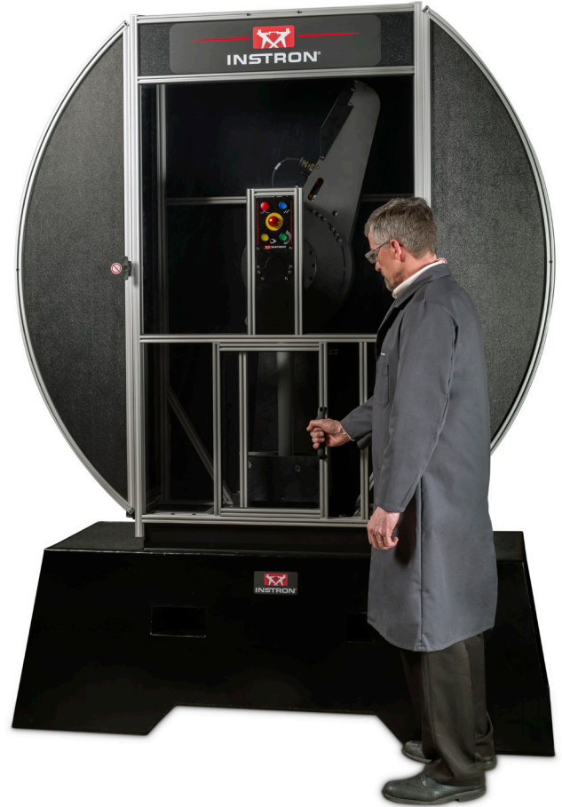
450MPX Impact System